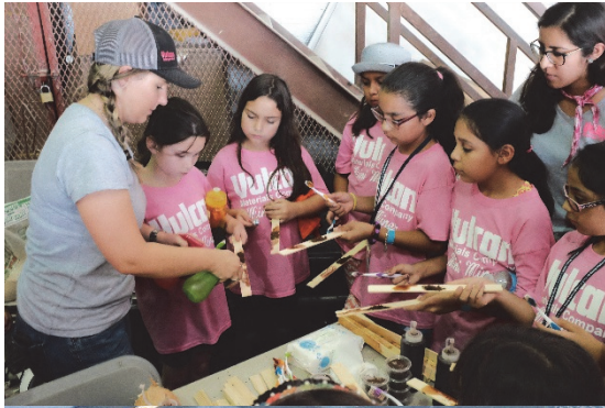
Local Girl Scouts learn about geology and conservation during a tour at our Helotes Quarry.

1,500 acre property 600+ acres of buffer, setbacks and non- mining areas 40% will not be mined