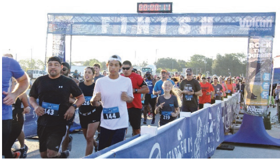
Runners take off for the inaugural Quarry Crusher Run at Vulcan's 1604 Quarry in San Antonio to benefit Soldiers' Angels.