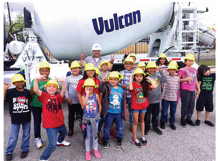
Frank Madla Elementary School hosted a Career on Wheels Day for kids to learn about a number of professions. A ready mix driver brought his truck along to teach kids all about concrete.