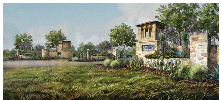
A paved, landscaped, decorative entrance off of FM 3009 draws from area architecture and surroundings.